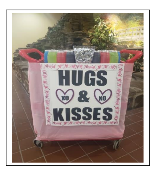
Hugs & Kisses for Our Residents